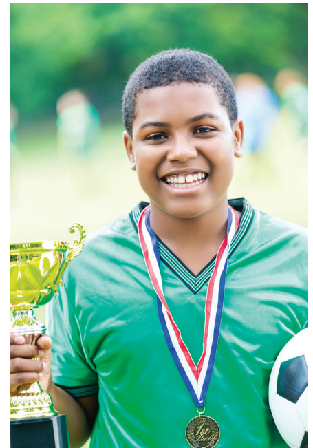
Performance-Approach Goals. Some students are motivated to show others their ability, like the boy showing off his soccer trophy.

Beliefs About Ability. Attributing success and failure to ability has different effects on motivation, depending on our belief about ability.