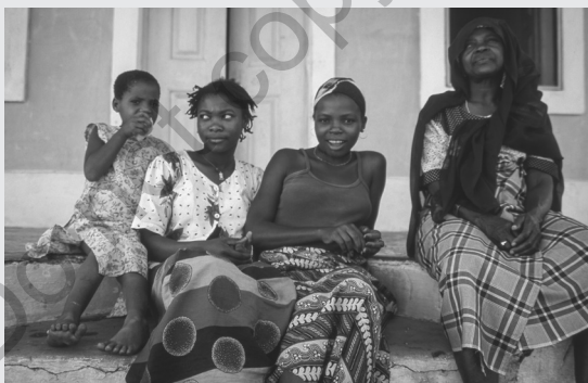
► Photo 1.2 Igbo women resting together.

belongs to her mother’s family—and multigenerational family members all related by blood rather than marriage live under one roof. In the Mosuo culture, the family carries through the mother’s line, and children, cared for by their maternal aunts and uncles, stay with