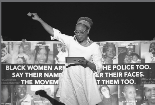
► Photo 1.3 Kimberlé Crenshaw speaking about police violence against Black women.

ties, media, policy makers, politicians, and the law view matters of injustice that are central to change.