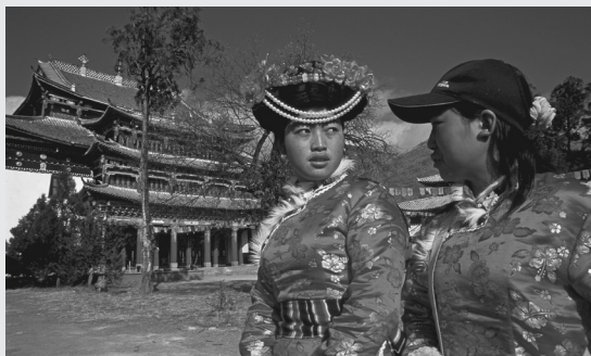
► Photo 1.1 Two Mosuo women.

the mother their entire lives. A mother “passes” her power over family decision-making to her eldest daughter, although most decisions are made collectively with input from all family members. 17 As one photographer who spent a month documenting local practices noted, “Men and women are very much equals, but the women are just a little more in charge.” 18