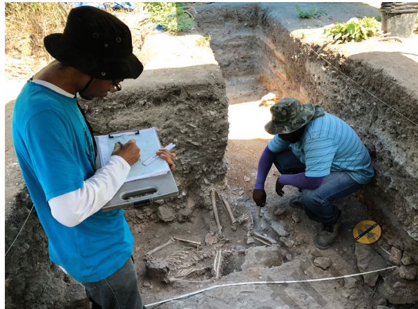
Staff and students from The University of the West Indies, Mona, document a human burial discovered during excavations at White Marl in Jamaica. One of the largest pre-Columbian settlements on the island, it has been continuously inhabited from AD 850 to the Spanish conquest in the 16th century.

have helped provide independent evidence for the African origins of the human species.