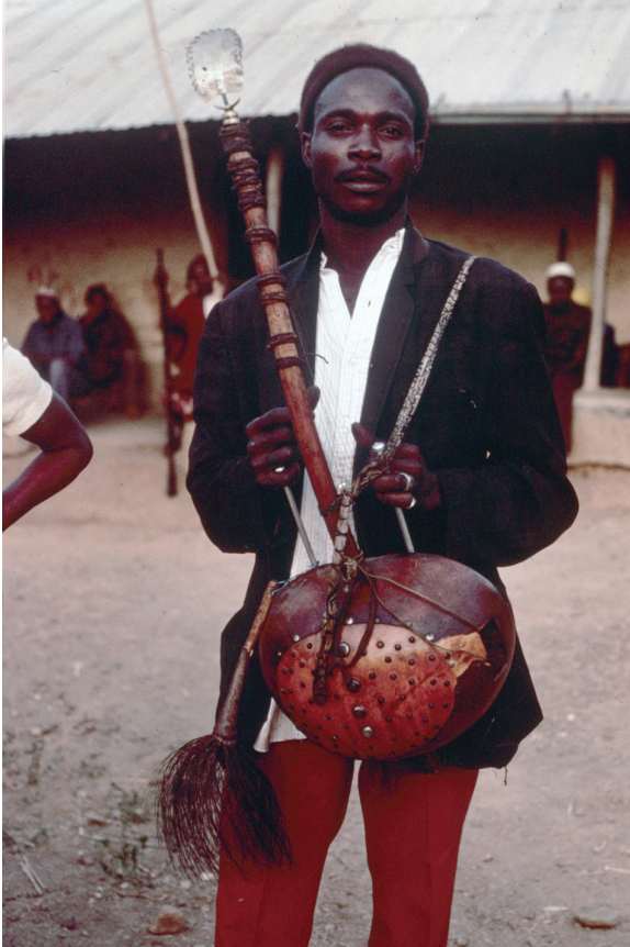
This photo shows a blind Yalunka musician from Sierra Leone in West Africa. Ethnomusicologists study musical traditions from every area of the world.

Theories always remain open to further testing and evaluation. They are assessed in light of new data and may be invalidated by contradictory observations. The systematic evaluation of hypotheses and theories enables scientists to state their conclusions with a certainty that cannot be applied to personal and culturally construed knowledge.