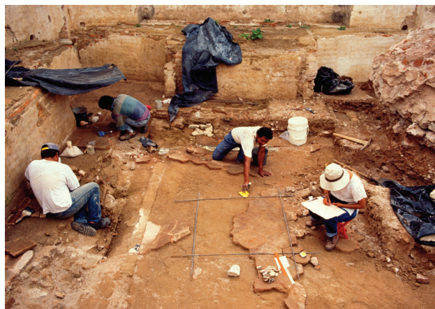
Archaeologists excavating at the Santo Domingo Monastery, Guatemala, an important colonial site dating back to the sixteenth century.

There are many more areas of specialization within archaeology that reflect the geographic area, topic, or time period on which the archaeologist works. Ethnoarchaeologists study the material artifacts of the past along with the observation of modern peoples who have knowledge of the use and symbolic meaning of those artifacts. Another distinctive area of focus is underwater archaeology, distinguished by the equipment, methods, and procedures needed to excavate under water. Underwater archaeologists investigate a wide range of time periods and sites throughout the world, ranging from sunken cities to shipwrecks. The array of other areas of archaeological specialization are listed in Figure 1.1.