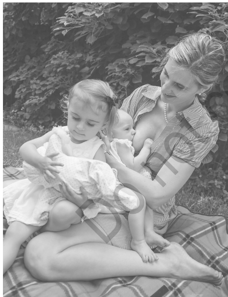
PHOTO 2.2 Learning gendered behavior: After the birth of a new sibling, this preschooler uses a doll to imitate her mother's breastfeeding.

Gender typing: The acquisition of gender-typed behaviors and learning of gender roles.