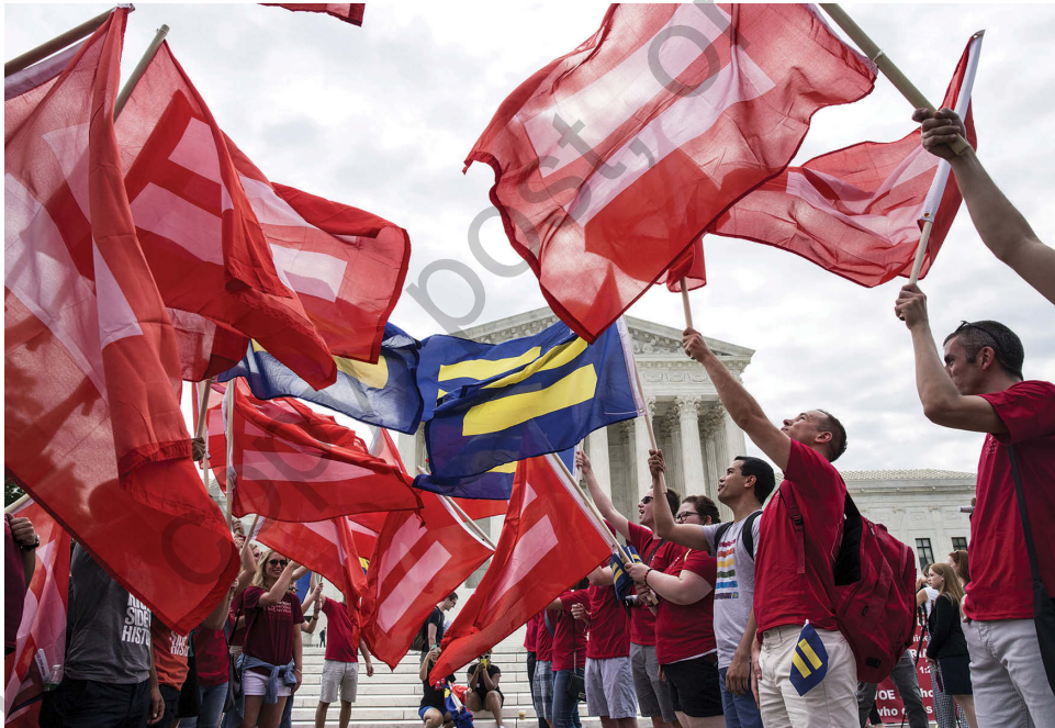
PHOTO 2.2 Supporters of gay marriage rally in front of the Supreme Court in Washington.

To understand those rules, review Figure 2.2. The baseline, or minimum, requirement of the Fourth Amendment is that the government act reasonably. Searches and seizures must always be reasonable; and sometimes, police only have to be reasonable. That is the bottom of the pyramid. In other cases, being reasonable isn't enough. The state must also have probable cause . It takes credible evidence, not just a suspicion or a hunch, to prove probable cause. Many searches and seizures are permitted when the government has probable cause and has acted reasonably. Finally, you see the warrant requirement at the top of the pyramid. A warrant is a court order to conduct a search, make an arrest, or seize property. Whenever a warrant is required, everything below it on the pyramid is also required (reasonable behavior and probable cause). The point of a warrant is to protect society's most private spaces by interposing a judge between the individual and the state. Only a neutral judge may issue a warrant, the officer who