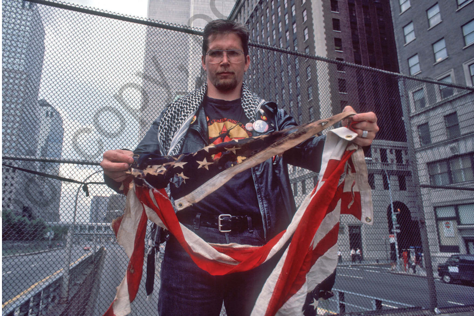
PHOTO 2.1 Flag-burner Gregory Johnson won his case for burning the U.S. flag on free speech grounds.

Section 1 of this law is vague. Reasonable people can, and will, disagree over what constitutes an insult, harassment, an annoyance, or what is offensive. Section 1 is also overbroad. Likely, you have not studied free speech, so you may not be aware that the First Amendment protects a wide range of expression, including “hate speech.” Although there are limits to the First