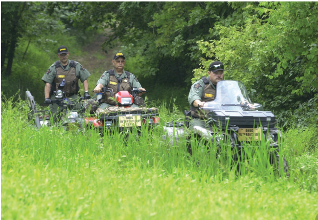
This photo shows a nontraditional view of police officers. Here, rural county sheriff's department officers travel by all-terrain vehicles in search of meth labs that have sprouted in hard-to-reach locales.

State police agencies have the responsibility for traffic enforcement on highways, particularly in areas outside the city or township limits. Some agencies focus almost exclusively on traffic control (highway patrol departments), and others maintain more general enforcement powers (state police investigation departments). 22 Typically, the state police are empowered to provide law enforcement service anywhere in the state, while the highway patrol officers have limited authority based on their specific duty assignment, type of offense, or jurisdiction.