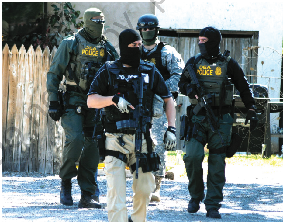
Federal agencies exercise police powers regarding a specific set of duties. For example, the Drug Enforcement Administration is tasked with enforcing controlled substance laws.

In 2016, racial or ethnic minorities comprised 29% of local police officers, according to the most recent United States Bureau of Justice Statistics Report. 30 That is up from the first published study in 1987, which showed 15% minority officers, and 25% minority officers in 2007. 31 Likewise, in 2016, 12% of local police personnel were identified as female, who were twice as likely to work in departments that served 250,000 or more residents than jurisdictions with fewer than 25,000 residents (16% and 8%, respectively). 30 Although future chapters in this text will further examine the changes in our police workforce, one recent illustration of these changes can be seen in the 2020 graduation class of the John Jay College of Criminal Justice in New York. Of the 4,145 students graduating, 59.6% of the graduates were women. 31