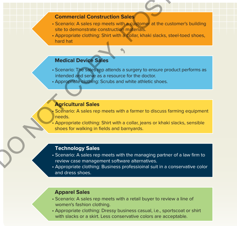
Figure 1-2 What Is Professional Dress?

What does it mean to be a professional? It means keeping your word, being reliable, and dependable. You maintain open lines of communication, and that communication has a professional tone. You dress appropriately for the industry and customers (see Figure 1-2 for examples). You care about the job and clients, and always behaves with integrity. Salespeople are often perceived to be unethical because they are attempting to persuade. To counter this perception, the