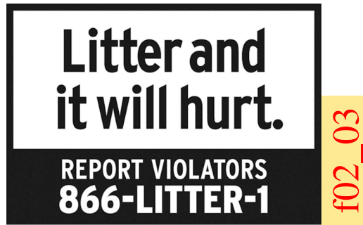
FIGURE 2.3 ■ Road Sign for Reporting Littering