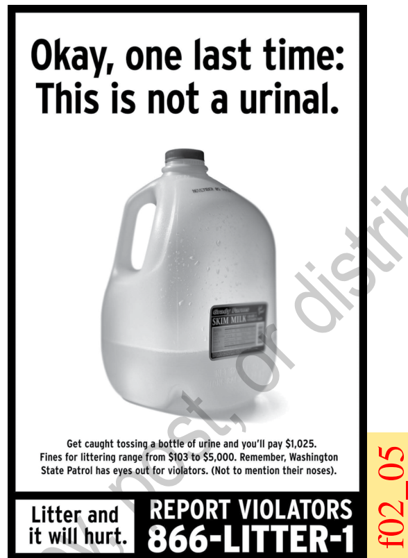
FIGURE 2.5 ■ Washington State's Litter Poster at Truck Weigh Stations