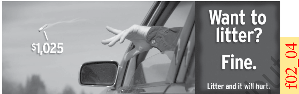
FIGURE 2.4 ■ Washington State's Litter Campaign Focused on a Hotline and Stiff Fines