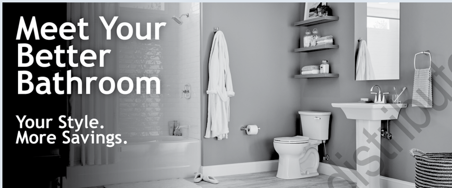
FIGURE 2.1 ■ A Graphic in the WaterSense Toolkit That Can Be Used by Partners Such as a Utility Bill Statement Stuffer