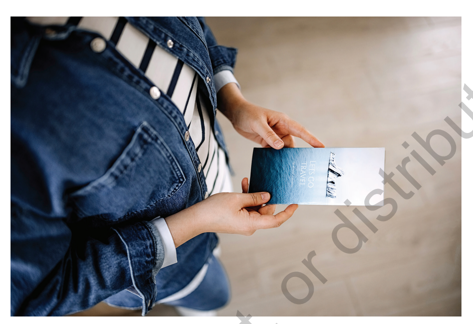
Meet Nia, who is assessing her desire to travel and experience new things after graduation.

When you don't know your money values, you can easily make a decision that is misaligned with your money values or find yourself subject to decision drift —making decisions as they come up without intentionally checking in with yourself on what you truly want. When we drift, we're highly influenced by our circumstances and the people around us. A little drift is normal, but too much drift can lead to a college major or career choice that doesn't match your natural abilities and long-term goals, a significant amount of debt, or unhealthy relationships that impact your financial wellness.