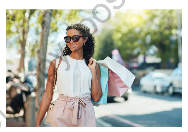
Meet Elsie. She uses shopping as a stress reliever.

Elsie likes to spend money on clothes, shoes, and hobbies. Shopping is her go-to stress reliever, and she can easily spend a good part of her paycheck on impulsive purchases when she's had a particularly tough week. Elsie reflects on her money memories and reads through the money scripts. She quickly identifies with the money worship category, and specifically with the scripts "I deserve money and nice things" and "Money can solve all my problems."