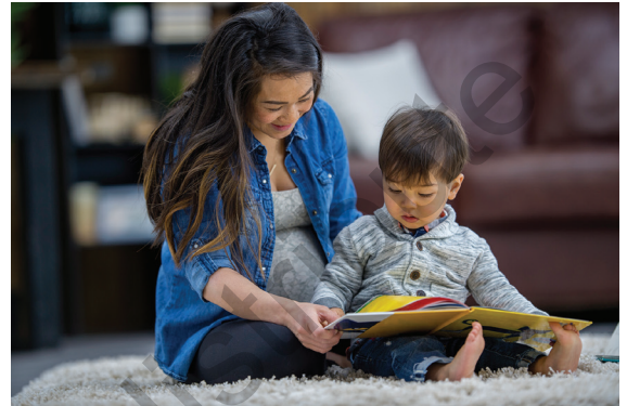
Achievement and SES. Achievement differences stemming from socioeconomic status may be due to differences in access to resources, such as books and computers.

Prejudice feelings can affect the way a teacher makes decisions about instruction, grouping, motivation, and assessment. Treating individuals differently based on prejudice feelings or biased beliefs