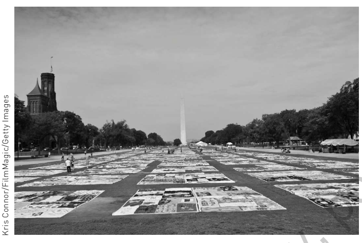
The AIDS Memorial Quilt was created with the goals of memorializing those who have died of AIDS-related causes and helping people understand the impact of the disease.

men. This stigmatization of those with the disease and the ascription of moral failing led to huge public protests by groups such as ACT UP and the creation of the AIDS quilt as seen in Photo 1.6 (Madson, 2012; The Names Project Foundation, 2018). Such activism ultimately resulted in government recognition of HIV/AIDS as a health crisis worthy of government attention. Public investment turned what had been a leading cause of death among young men in the early 1990s into a disease that today can be controlled and suppressed with medication (Centers for Disease Control and Prevention, 1998). The organizing that occurred within communities affected by this disease helped fuel and strengthen the civil rights movement for people who identify as lesbian, gay, bisexual, transgender, queer, and with other sexual orientations or gender identities (LGBTQ+). During Bush's presidency, initiatives by religious nonprofit organizations were encouraged under the White House Office of Faith-Based and Community Initiatives (US Department of Justice Archive, n.d.). Such efforts raised concerns regarding the separation of religion and state.