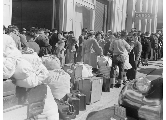
San Francisco, California. With Baggage Stacked, Residents of Japanese Ancestry Await Bus

Many of the New Deal programs ended by 1934, but they paved the way for the creation of the Social Security Act, passed by Congress in 1935 with significant input from social workers such as Perkins, Harry Hopkins, and Wilbur J. Cohen (profiled in Chapter 9). The Social Security Act was one of the few permanent results of this time period, and provided assistance for older adults (through the Old Age Insurance program—what most people think of when they think of Social Security) and people with disabilities (Social Security Disability Insurance). As with other programs of the era, Black Americans were subject to discrimination as a result of the program design. The Social Security Act deliberately excluded domestic and agricultural workers, the majority of whom were Black, from Old Age Insurance (Brown, 1999). You can read more