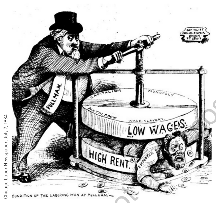
The Condition of Laboring Man at Pullman

Politics were marked by corruption and systems of patronage, whereby politicians garnered votes by using their power to reward supporters. The patronage system itself was legal, and federal, state, and local politicians of the day, including President Andrew Jackson, used it openly (Riordan, 1995). The right to vote was among the few means of leverage and power that members of immigrant groups held. Patronage systems (New York's Tammany Hall was one of the most infamous) were therefore mutually beneficial for many elected officials and the immigrant groups or neighborhoods where they lived. They were one of the few avenues that populations marginalized by discrimination could use to gain access to employment opportunities and services, particularly at the local level. The patronage system was curbed by the Pendleton Act of 1883, which led to the creation of a federal civil service system based on merit rather than favors to supporters; similar state legislation followed. While legislation could not entirely eliminate favoritism, it helped build a civil service system made up of workers who had knowledge and expertise that did not change with political winds.