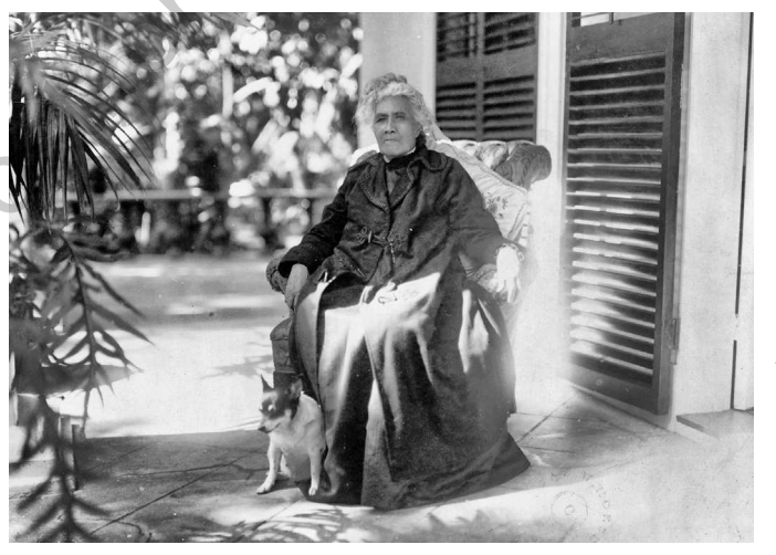
Queen Lili'uokalani in 1917.