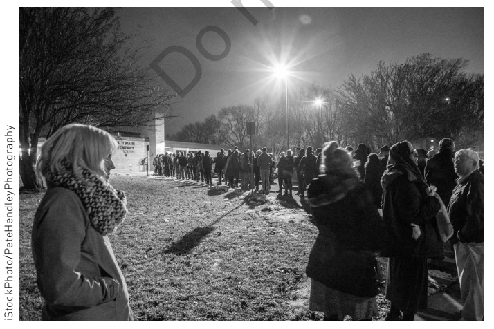
Voters standing in line for the 2016 Democratic Iowa Caucus.

We devote this chapter to race and structural oppression in the United States, a country that has promised equality and justice, but was founded and has thrived on colonization, slavery, conquest, and disregard for the humanity of those seen as "other," while at the same time, has been a land of opportunity for many. In this chapter, we center racism in its many forms, which are also discussed throughout the book. Many of the key terms, such as oppression, structural oppression, and intersectionality, can also be applied across other axes of privilege and disadvantage, and we hope that you will consider both the unique harms of racism as well as the ways these harms may affect other oppressed populations. While this critique may be seen by some as anti-American, we think that holding the United States accountable to the values that were espoused by our Founding Fathers is patriotic. We love the United States and would like to see it live up to its potential. It is our hope that by educating future social workers about the history and policy challenges in the United States, that together, we can make the United States a better, fairer, place for all. We don't expect this chapter to cover everything you might need or want to