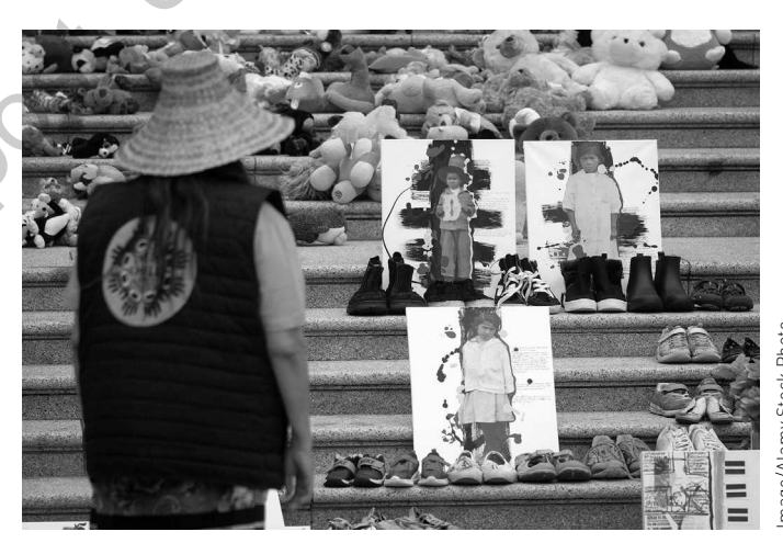
Memorial marking the one-year anniversary of the discovery of 215 Indigenous children buried at Kamloops Indian Residential School in Vancouver, British Columbia, Canada.

In the 1700s, the land that is now the United States was populated by around 150 million Indigenous people (Europe at the time had fifty million). The many nations here had infrastructure, including towns and complex trade routes. Many of the roads in use today are based on the routes that the Native populations had used (Dunbar-Ortiz,