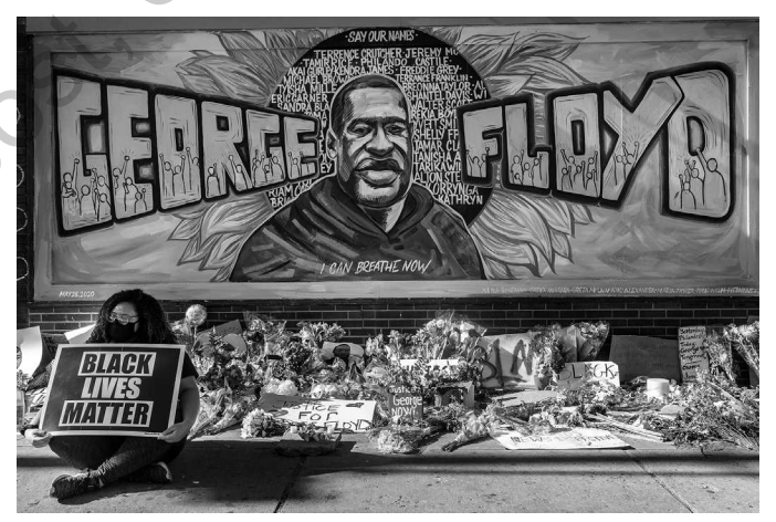
Memorial to George Floyd

Anti-blackness is one way some black scholars have articulated what it means to be marked as black in an anti-black world. It's more than just "racism against black people." That oversimplifies and defangs it. It's a theoretical framework that illuminates society's inability to recognize our humanity — the disdain, disregard and disgust for our existence.