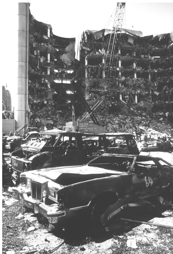
Image 5.1 The Bombing of the Murrah Federal Building in Oklahoma City, April 19, 1995