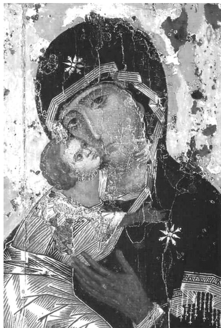
Image 5.2 One of the Most Famous Icons, the Theotokos of Vladimir, c. 1131

from 802 to 811, the subsequent emperors, Leo V, Michael II, and Theophilos, continued the icon-bashing until Michael III restored the icons in 843. From that point on, the iconoclasts never regained significant power.