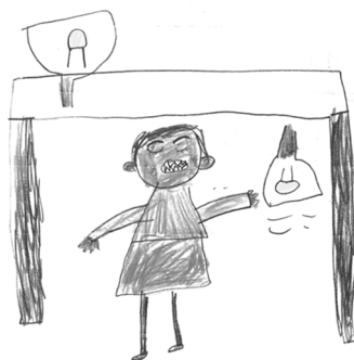
Figure 4.2 Writing Sample

when I was naughty I was only 4 and Slammed The lamp and my mum came up and I Hide at The Back of The chair and keji told my mum and my mum Samacke me with a Belt and sent me up my room for a week and I did NOT go to school. 25 th June when I was naughty.