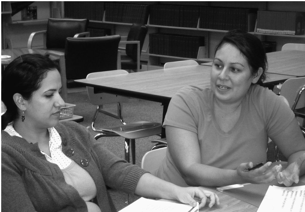
Talking about philosophies and beliefs can help faculty embrace the notion of inclusion.

Individuals with disabilities should be considered the same and have the same rights as individuals without disabilities. This means that all individuals with disabilities should have the right to participate in the same activities and routines as individuals without disabilities in their community, including having jobs and friends without disabilities. Although this idea has been supported by many advocates of individuals with disabilities, the question of how best to